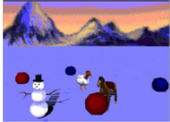
Figure 1: A screen shot of a prototype system

Figure 2 illustrates an overview of the system. The speech recognition module receives the user’s speech input and gives a sequence of words. The language understanding module analyzes the word sequence