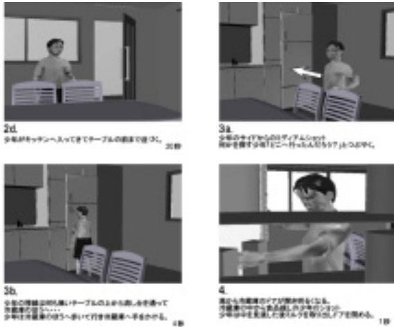
Figure 4: A fragment of the continuity for a scenario

The set of basic movements depends on the domain that the system deals with. In taking a bottom-up approach, we assumed a scenario in which two persons interact in a kitchen for a couple of minutes, and enumerated the verbs used to describe the scene. Figure 4 shows a fragment of the continuity for this scenario.