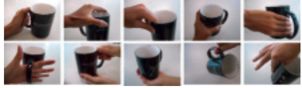
Figure 5: Classification of “grasp”

The second issue is the reusability of basic movements. As mentioned before, one of the advantages of a motion capture system is that it enables us to collect motion data easily. However, it is quite dif-