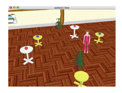
Figure 4: Snapshot of the dialogue system

dialogue system (Figure 4). The dialogue system has animated humanoid agents in its visualized 3D virtual world. Users can command the agent by speech to move around and relocate objects.