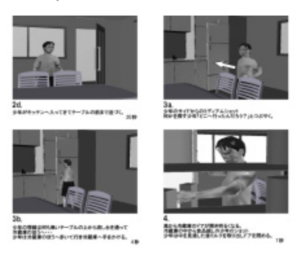
Figure 4: A fragment of the continuity for a scenario

The set of basic movements depends on the domain that the system deals with. In taking a bottom-up approach, we assumed a scenario in which two persons interact in a kitchen for a couple of minutes, and enumerated the verbs used to describe the scene. Figure 4 shows a fragment of the continuity for this scenario.