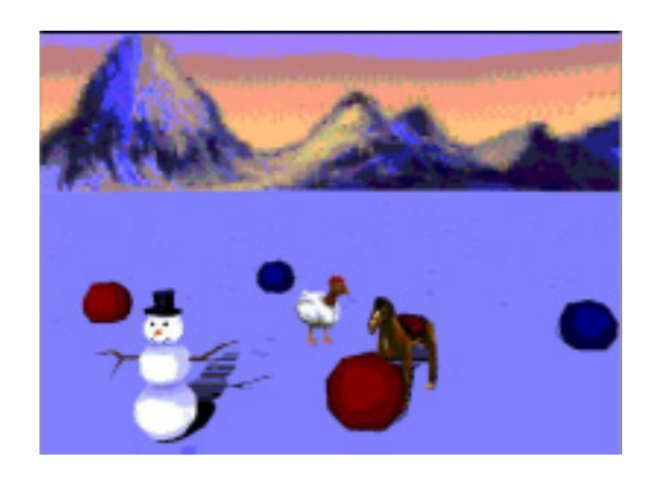
Figure 1: A screen shot of a prototype system

Figure 2 illustrates an overview of the system. The speech recognition module receives the user's speech input and gives a sequence of words. The language understanding module analyzes the word sequence